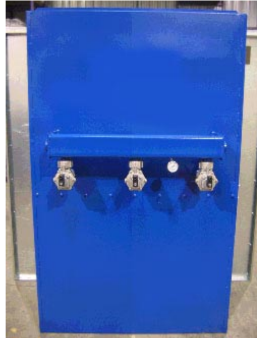
EBM-6 REAR VIEW